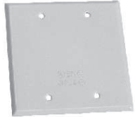
TP7296 - TP7298