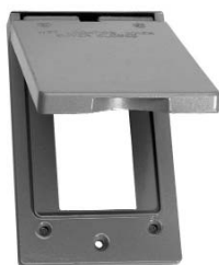
TP7240 - TP7242