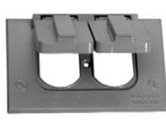
TP7206 – TP7209