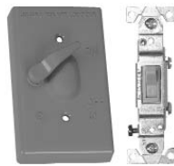
TP7260 5/8" Thick