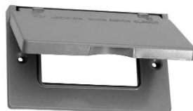
TP7236 - TP7238